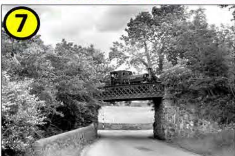
7 RHEILFFORDD CHWAREL PENRHYN PENRHYN QUARRY RAILWAY