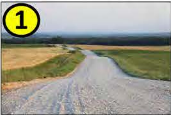
1 LÔN RHUFEINIG (AIL-GREAD) ROMAN ROAD (RECONSTRUCTION)