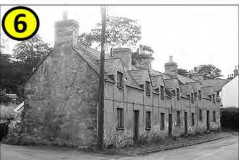
6 BYTHYNNOD STÂD PENRHYN (19ed GANRIF) PENRHYN ESTATE COTTAGES (19th CENT.)