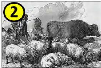
2 LÔN PORTHMYN DROVERS ROAD