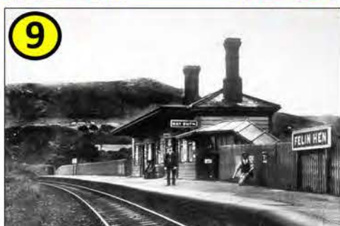
9 GORSAF TRÊN FELIN HÛN (tua 1920) FELIN HÛN RAILWAY STATION (ca. 1920)