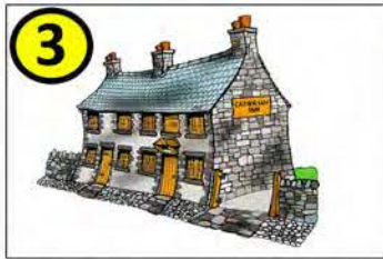
3 TAFARN Y CAMBRIAN (AIL-GREAD) CAMBRIAN INN (RECONSTRUCTION)