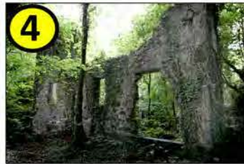
4 MELIN COED HOWEL COED HOWEL MILL