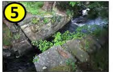
5 GWEDDILLION LLIFDDOR SLUICE GATE (REMAINS)