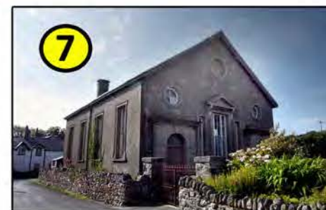
7 CAPEL MC CAERHUN (1831; AIL-ADEILADWYD 1895) MC CHAPEL CAERHUN (1831; RE-BUILT 1895)