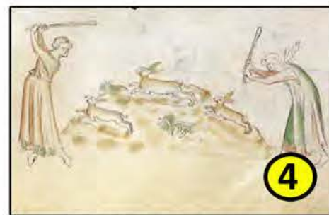
4 TOMEN GLUSTOG CANOLOESOL (MWND CWNINGOD) MEDIEVAL PILLOW MOUND (RABBIT MOUND)