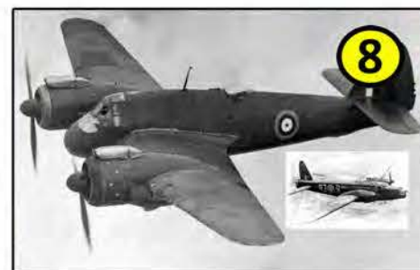
8 DAMWAIN AWYRENAU BRISTOL BULLFIGHTER A VICKERS WELLINGTON AIRCRAASH SITE BRISTOL BEAUFIGHTER AND A VICKERS WELLINGTON 31 HYDREF/OCTOBER 1942