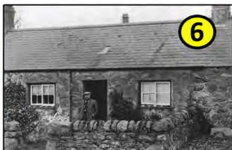
6 WAEN WEN - BYTHYNOD CHWARELWYR PENRHYN WAEN WEN - PENRHYN QUARRY COTTAGES