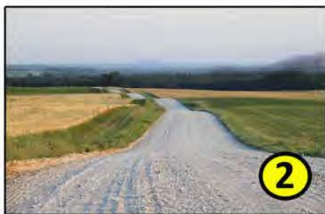
2 LON RHUFEINIG (AIL-GREAD) ROMAN ROAD (RECONSTRUCTION)