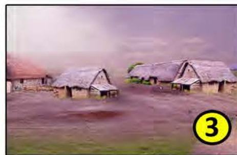
3 BRAS ARDAL TREFGORDD CANOLOESOL CAERWEDOG APPROX. AREA MEDIEVAL TOWNSHIP OF CAERWEDOG