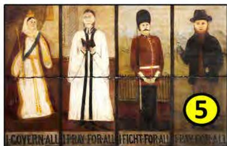
5 FOUR ALLS (CYN TAFARN PORTHMYN) FOUR ALLS (FORMER DROVERS' INN)