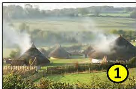
1 SAFLE PENTREF CELTAIDD PREHISTORIC SETTLEMENT (SITE OF)